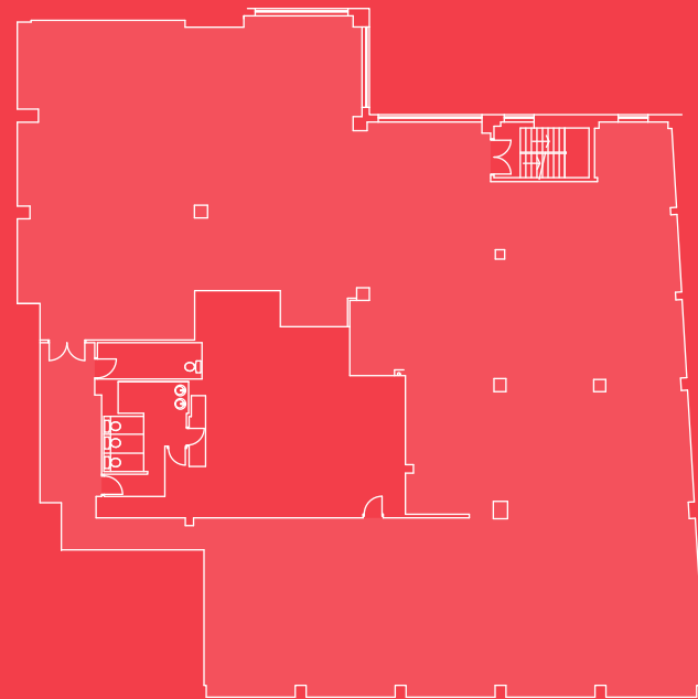
Lower Ground Floor: 6,985 sq ft / 649 sq m