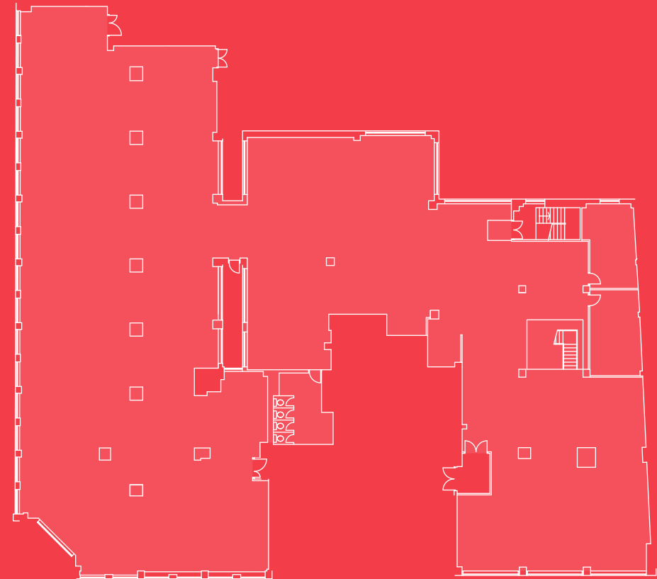
Ground Floor: 11,870 sq ft / 1,103 sq m