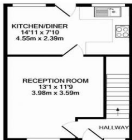
GROUND FLOOR APPROX. FLOOR AREA 312 SQ.FT. (29.0 SQ.M.)