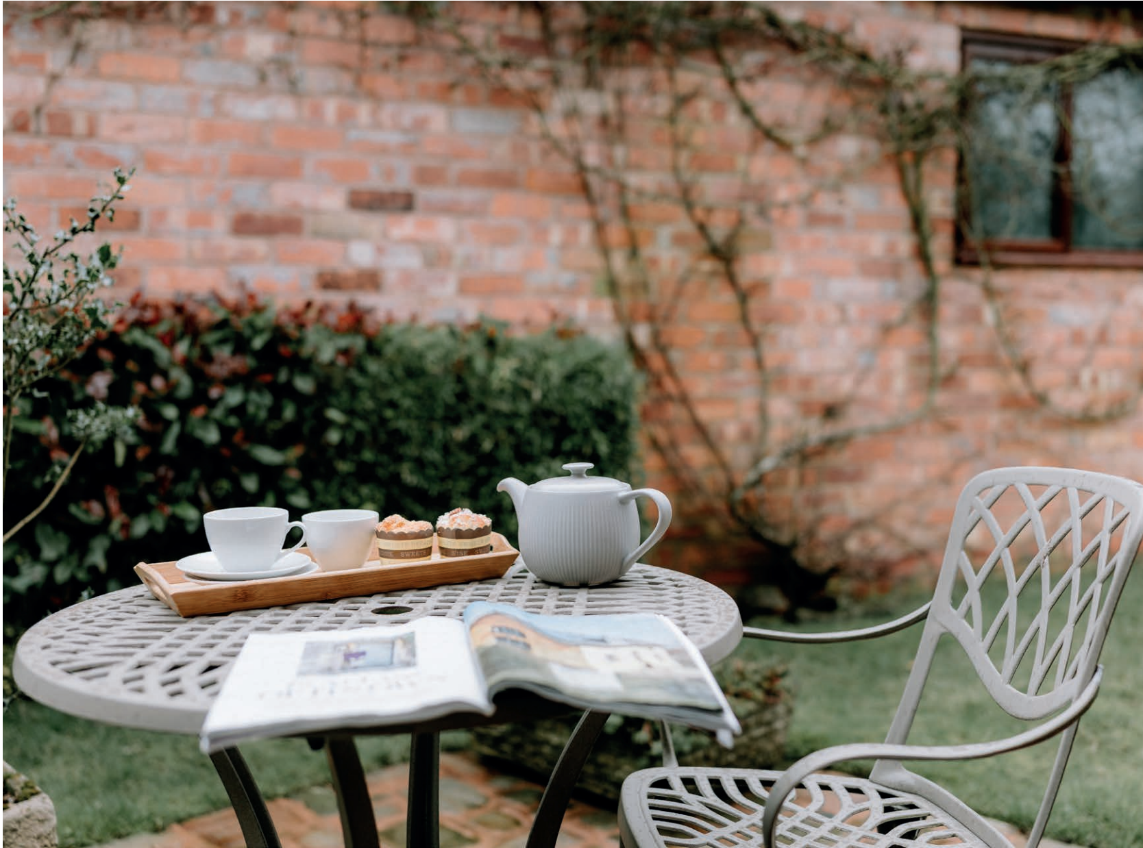
Garden Cottage, Oakmere