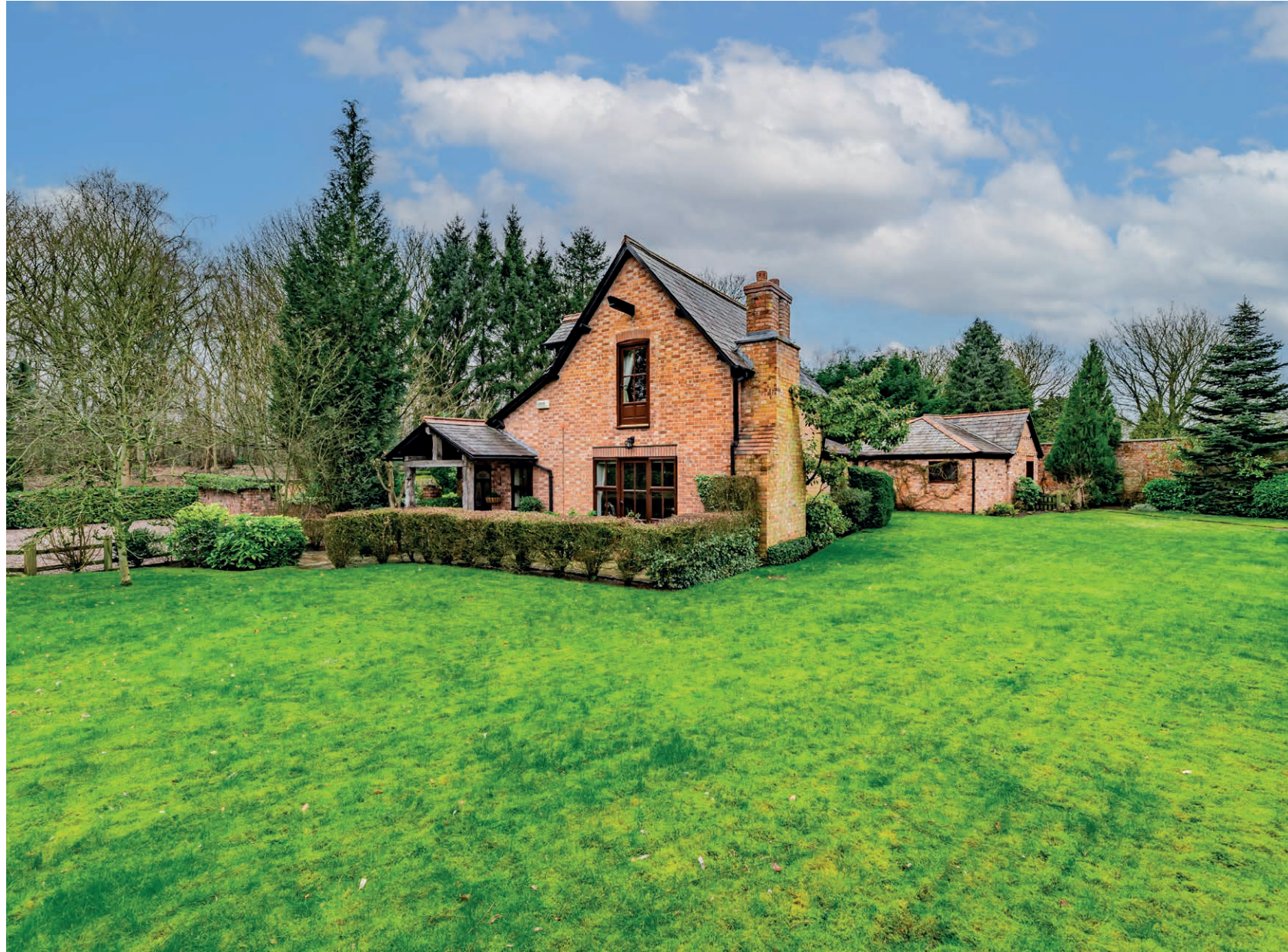
Garden Cottage, Oakmere