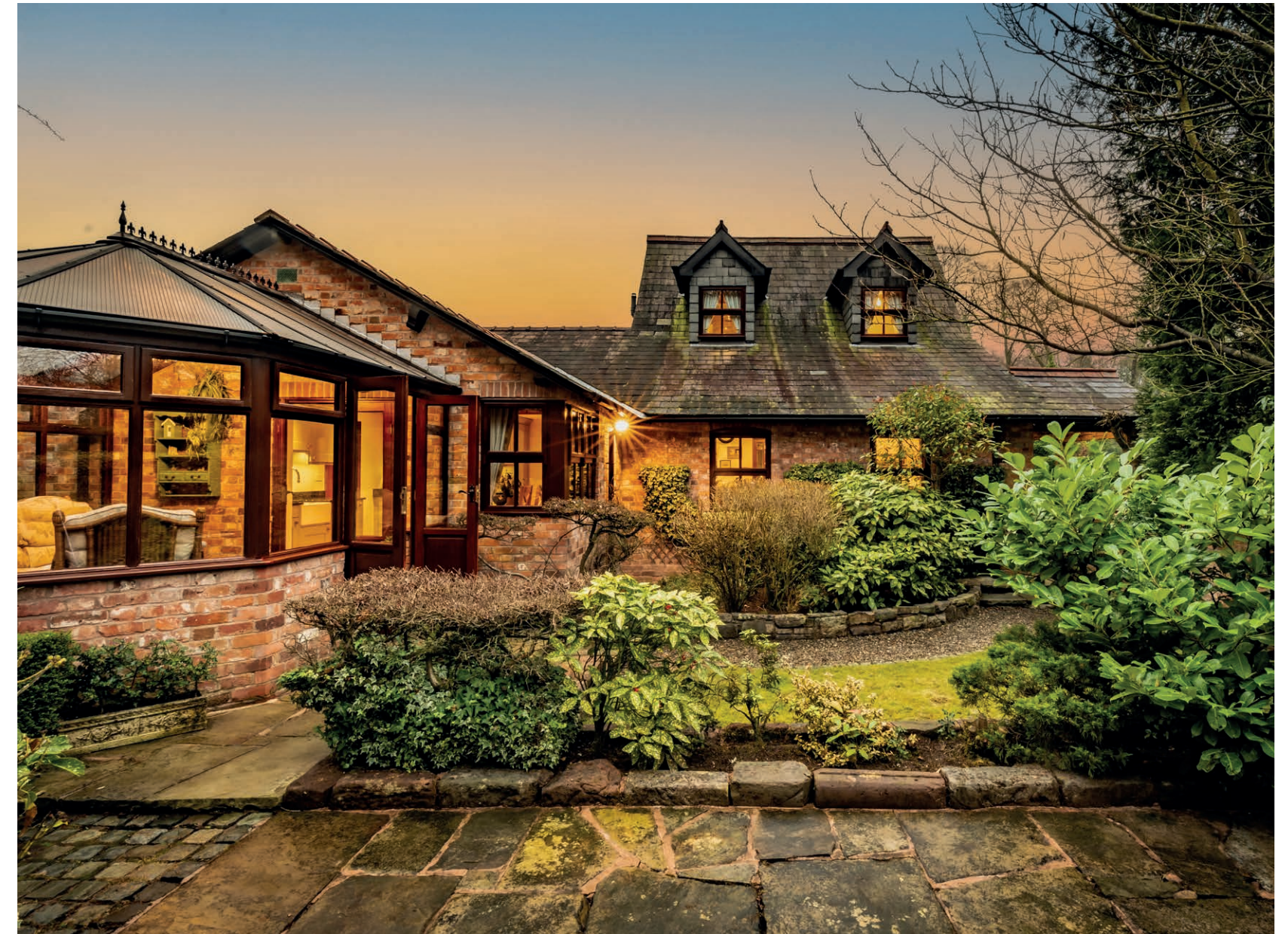
Garden Cottage, Oakmere

** Whilst every effort has been taken to ensure the accuracy of the fixtures and fittings mentioned throughout, items included in sale are to be discussed at the time of offering. **