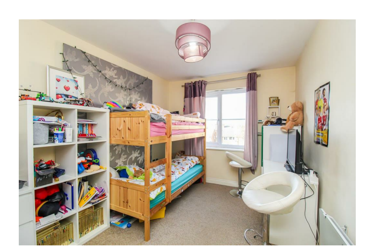
BEDROOM TWO 6'9" x 10'1" [2.07m x 3.09m] UPVC double glazed window to the front.