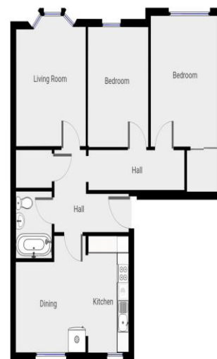
THIS FLOORPLAN IS PROVIDED WITHOUT WARRANTY OF ANY KIND. CAUTION: ANY WARRANTY INCLUDING, WITHOUT LIMITATION, SATISFACTORY QUALITY OR ACCURACY OF DIMENSIONS.