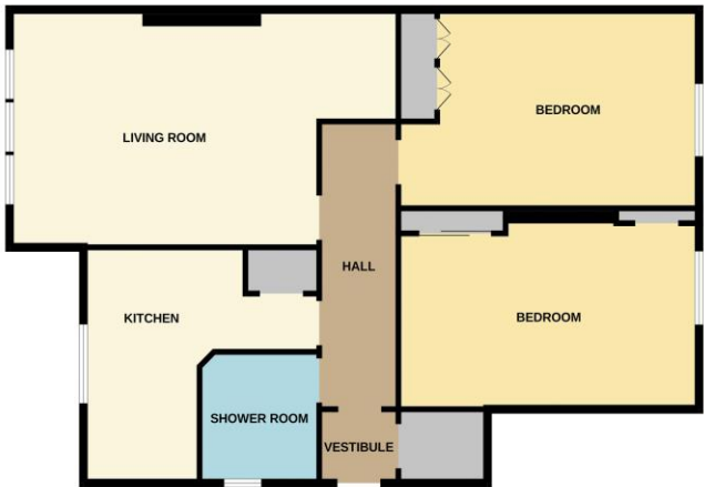
111 LOCHFIELD ROAD, PAISLEY

Whilst every attempt has been made to ensure the accuracy of the floorplan contained here, measurements of plots, buildings, rooms and any other items are approximate and no responsibility is taken for any error, omission or misstatement. This plan is for illustrative purposes only and should be used on such for any prospective purchaser. The services, fixtures and appliances shown here are not shown based on any guarantee as to their operation or existence to be given. Made with Metaphor E2020