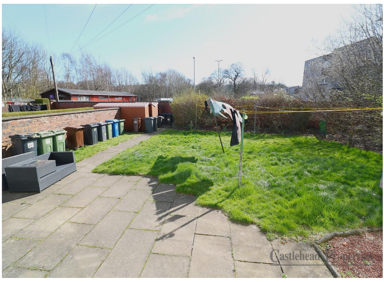
OFFERS OVER £50,000