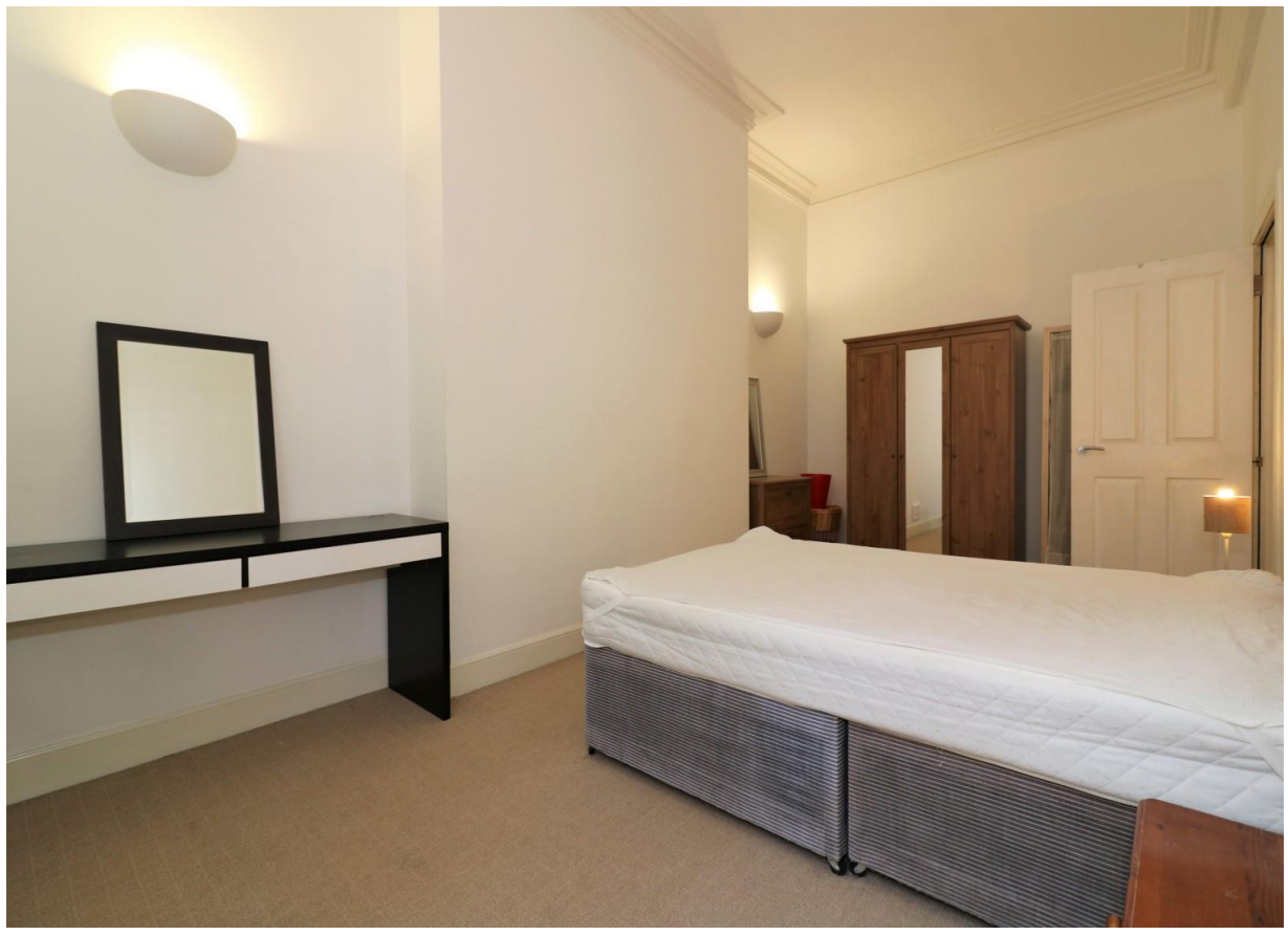
OFFERS IN THE REGION OF £135,000