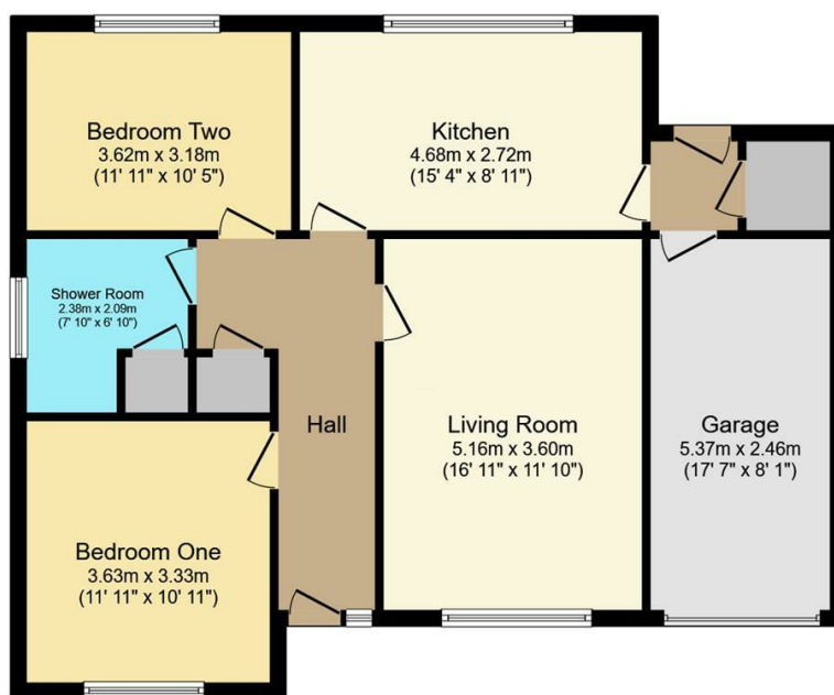
Floor Plan Floor area 85.9 sq.m. (925 sq.ft.)

Total floor area: 85.9 sq.m. (925 sq.ft.)