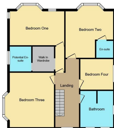
First Floor Floor area 95.5 sq.m. (1,028 sq.ft.)

Total floor area: 205.8 sq.m. (2,215 sq.ft.)