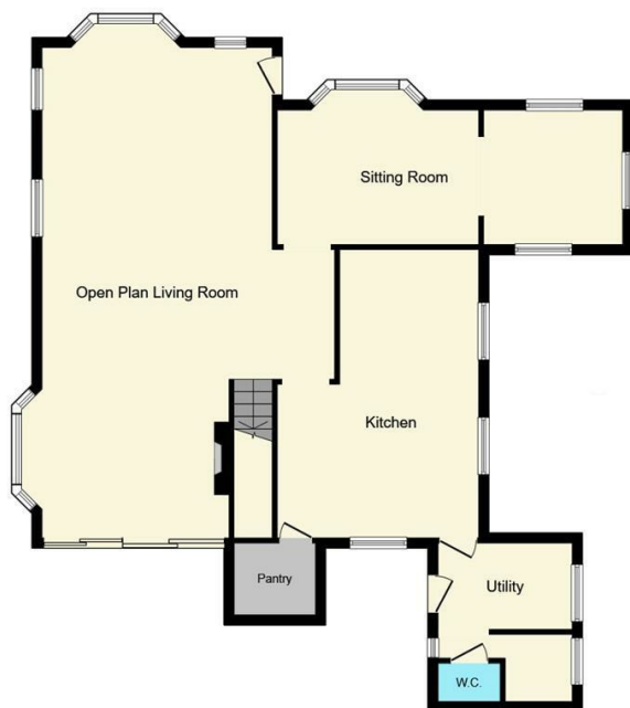
Ground Floor Floor area 110.3 sq.m. (1,187 sq.ft.)