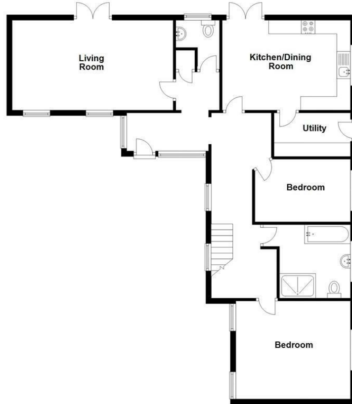
Ground Floor Approx. 137.2 sq. metres (1476.3 sq. feet)