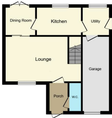
Ground Floor Floor area 43.0 m 2 (463 sq.ft.)