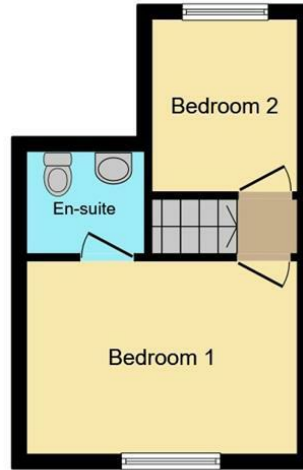
First Floor Floor area 21.5 m 2 (232 sq.ft.)