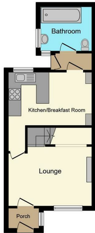
Ground Floor Floor area 33.4 m 2 (360 sq.ft.)