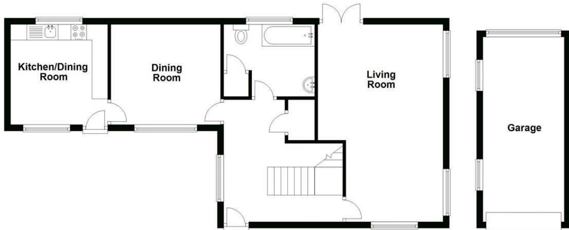
Ground Floor Approx. 81.2 sq. metres (873.8 sq. feet)