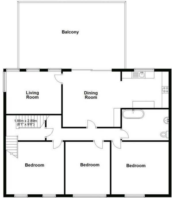
First Floor Approx. 100.1 sq. metres (1077.7 sq. feet)