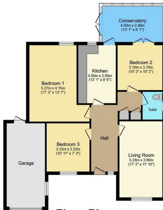
Floor Plan Floor area 107.5 sq.m. (1,157 sq.ft.) approx

Total floor area 107.5 sq.m. (1,157 sq.ft.) approx