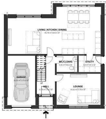
GF Ground Floor Plan 1:100