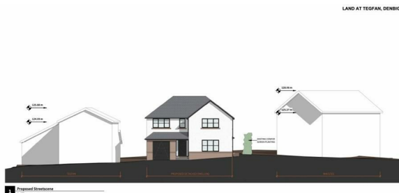
S Proposed Sitelines

Land at Tegfan | Denbigh SCALE: As Indicated @ A3 | JULY 2023 | REVISION: P2 Drawing Scale 1:100 @ A3