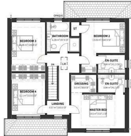
FF First Floor Plan 1:100