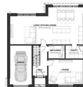
GF Ground Floor Plan 1:100