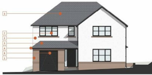
F Front Elevation 1:100