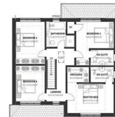
1F First Floor Plan 1:100