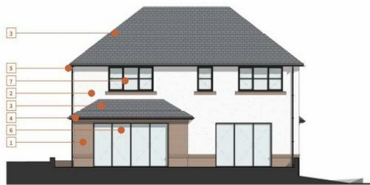
R Rear Elevation 1:100