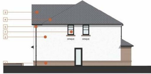
RH RH-Side Elevation 1:100