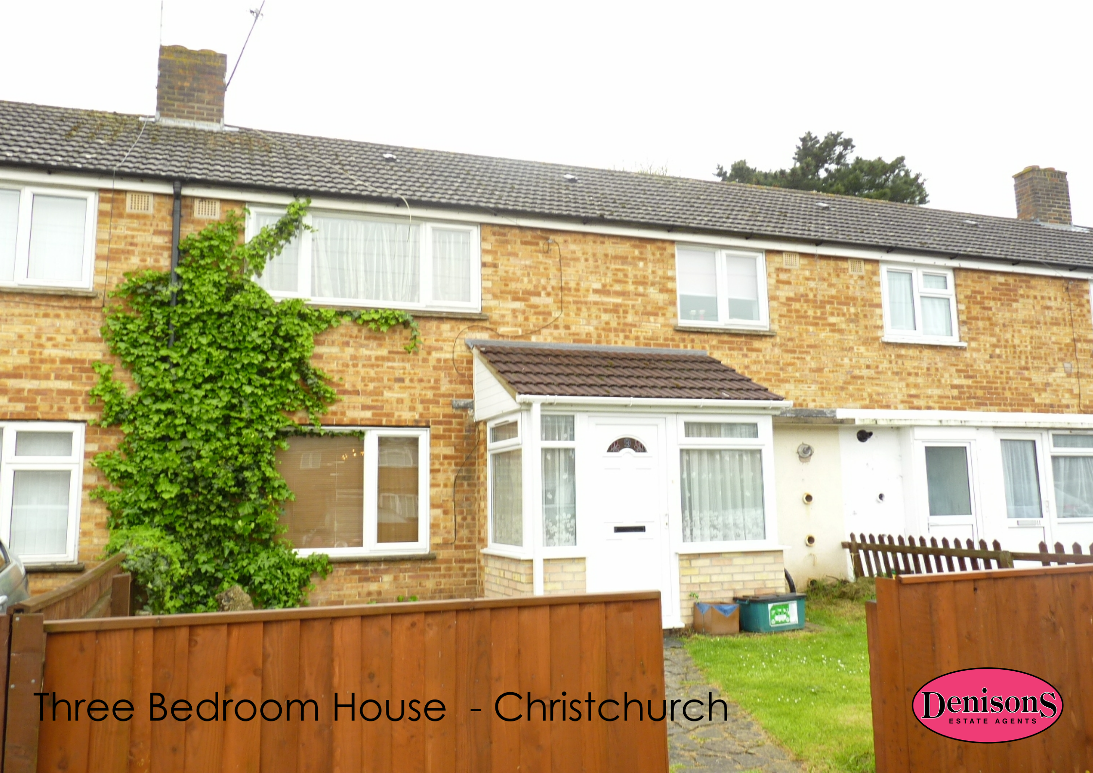
Three Bedroom House - Christchurch