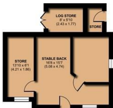
OUTBUILDING 1 / 2 / 3