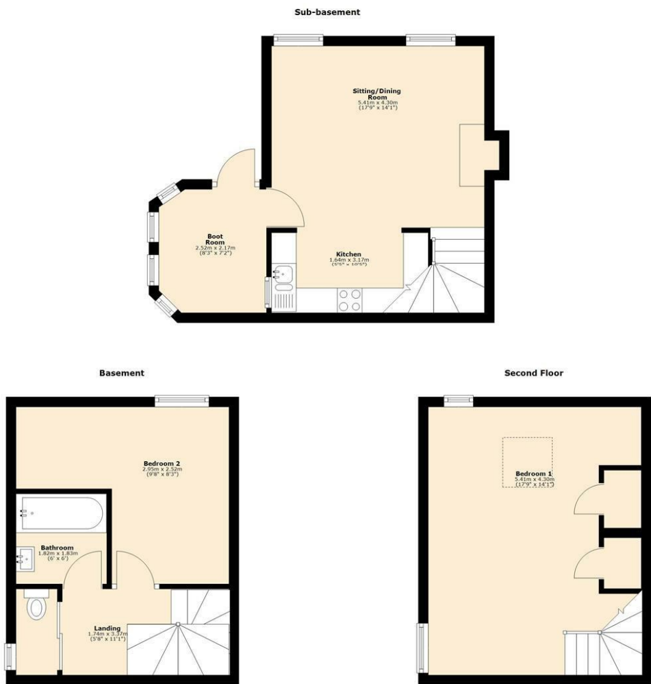
8 The Terrace, Low Bentham