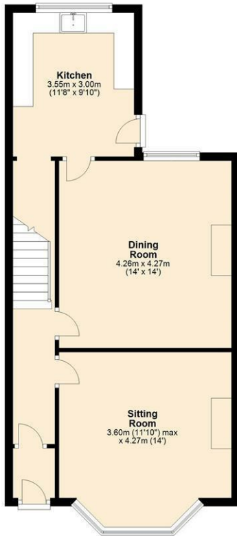
Ground Floor Approx. 55.0 sq. metres (592.2 sq. feet)