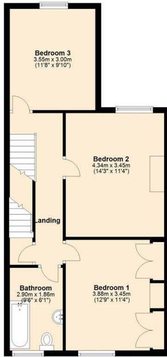
First Floor Approx. 56.0 sq. metres (602.4 sq. feet)