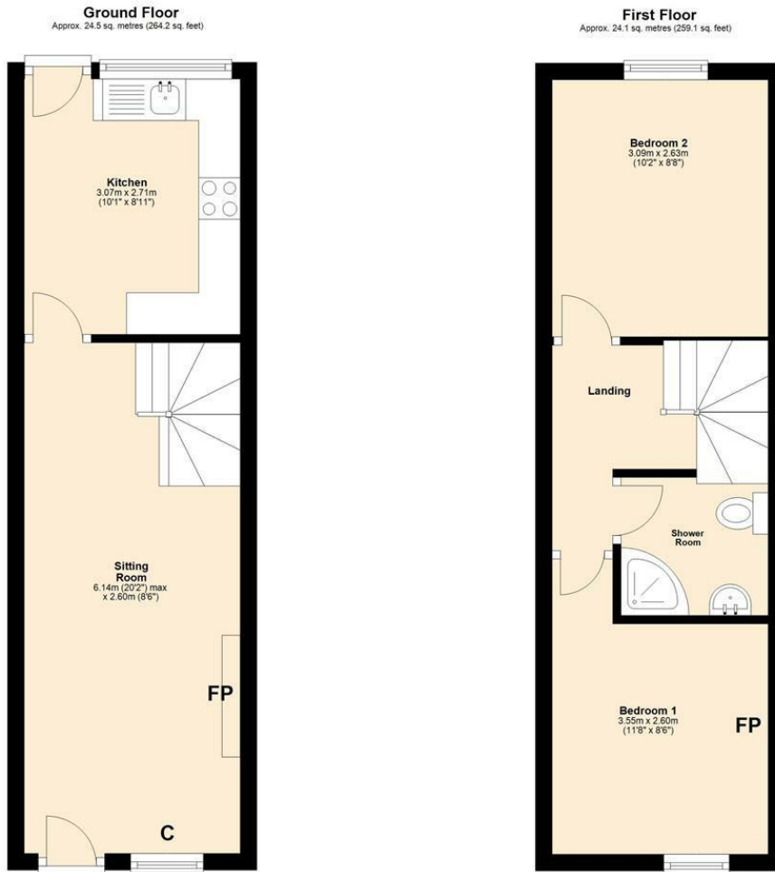
Total area: approx. 48.6 sq. metres (523.2 sq. feet) Honeypot Cottage, Bentham