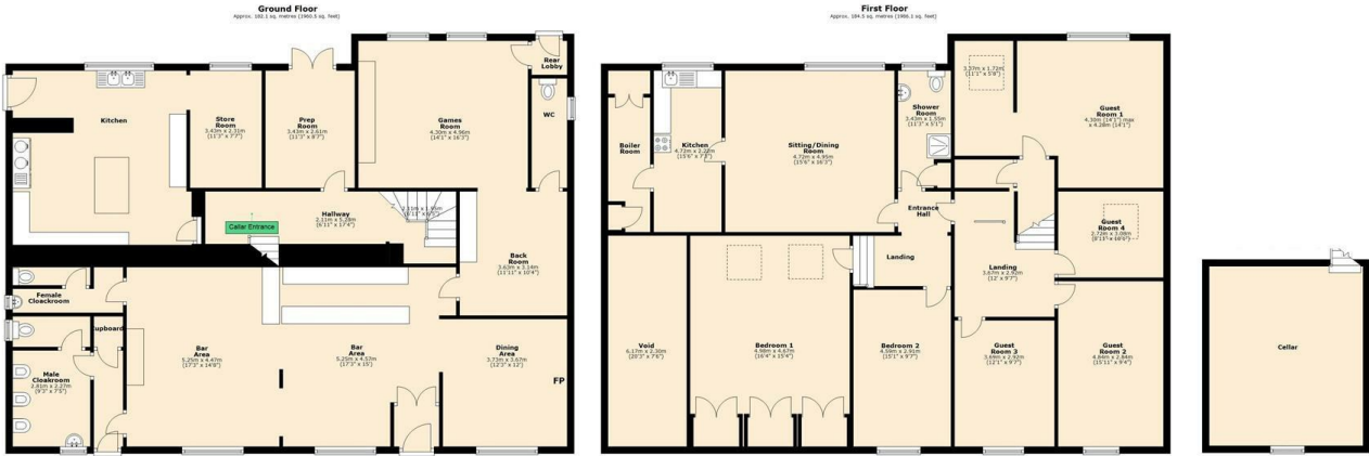
Total area: approx. 390.3 sq. metres (4265.7 sq. feet) The Punch Bowl, Low Street, Burton in Lonsdale