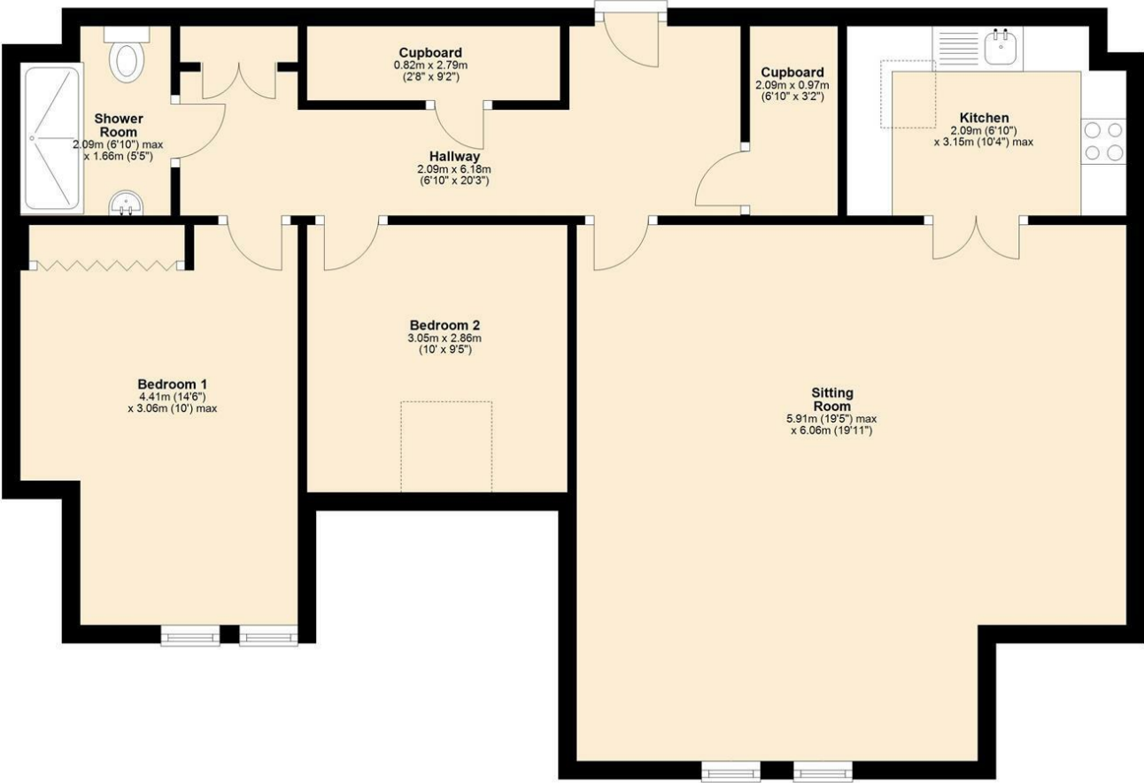
Total area: approx. 80.8 sq. metres (869.9 sq. feet) 56 Blackhall Croft, Blackhall Road, Kendal