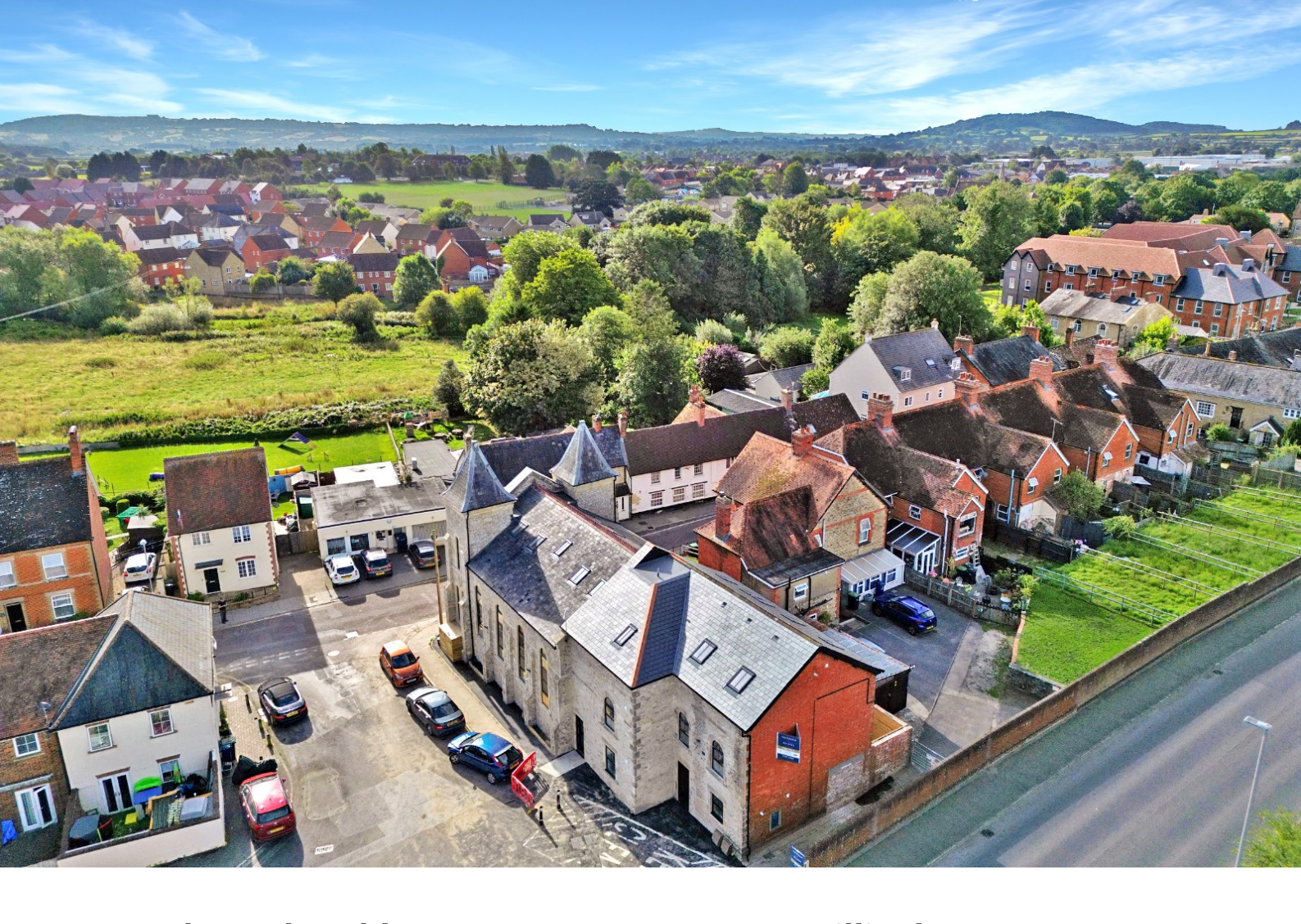
Flat 4 Churchbury House Queen Street, Gillingham, Dorset. SP8 4DZ £170,000