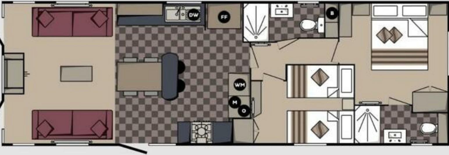
Outlook - 40 x 13 - 2 Bedroom

Ross Nicholas & Company Limited 334 Lymington Road, Highcliffe, Dorset, BH23 5EY 01425 277 777 highcliffe@rossnicholas.co.uk