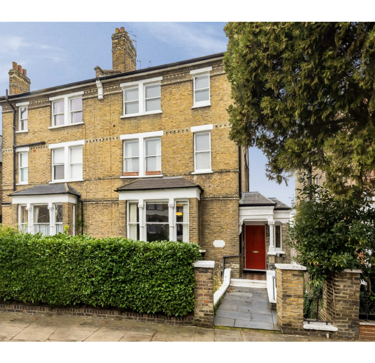
Dartmouth Park Avenue, NW5