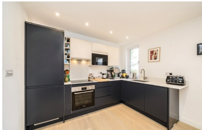
Crouch End Hill, N8