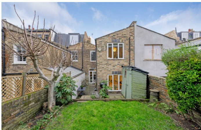
Spencer Rise, NW5