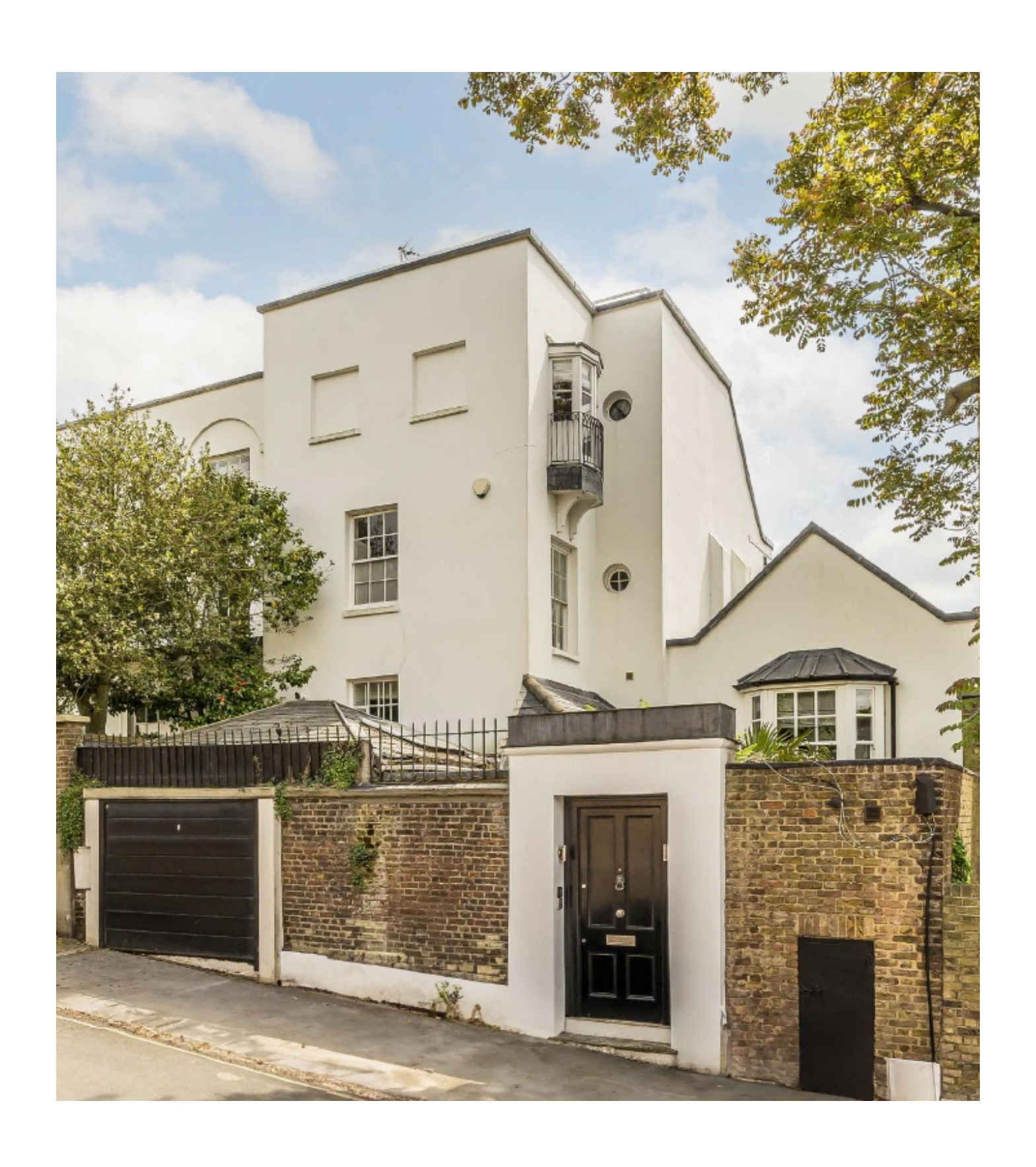
Highgate West Hill, N6 £5,250,000