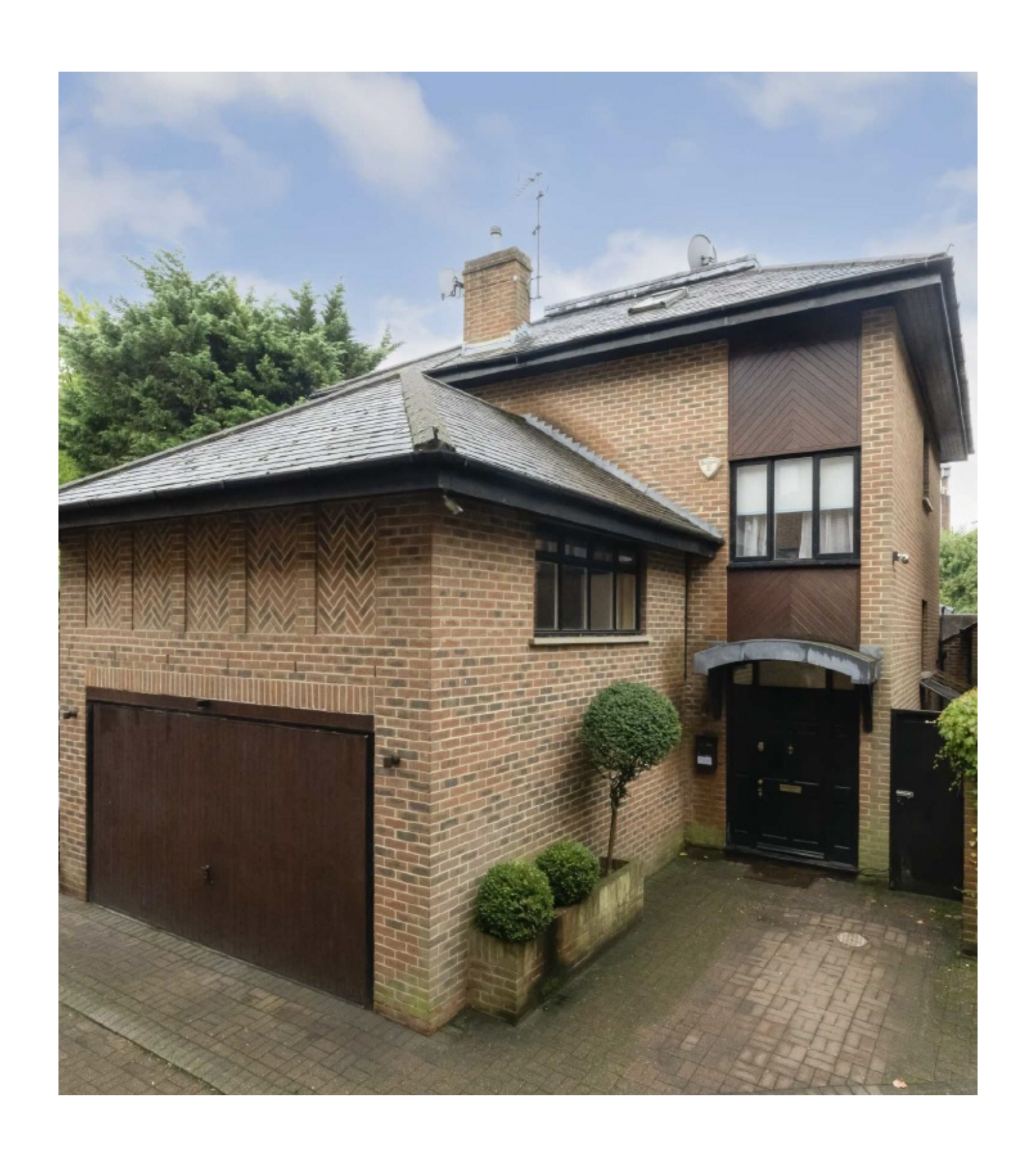
Dukes Head Yard, N6 £2,250,000