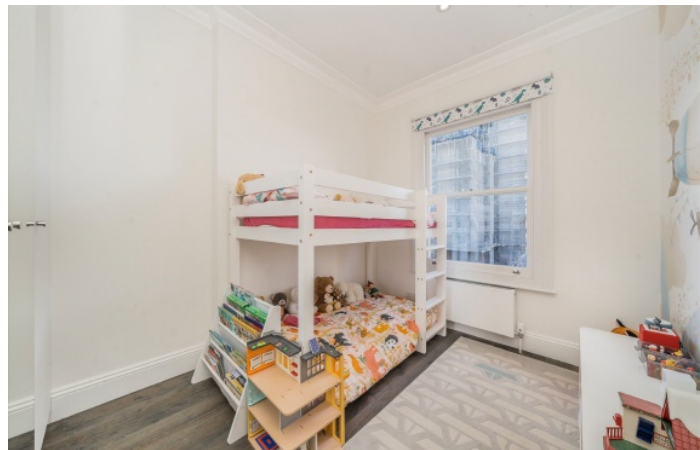
Fellows Road, NW3