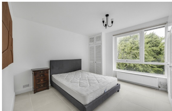
Netherhall Gardens, NW3