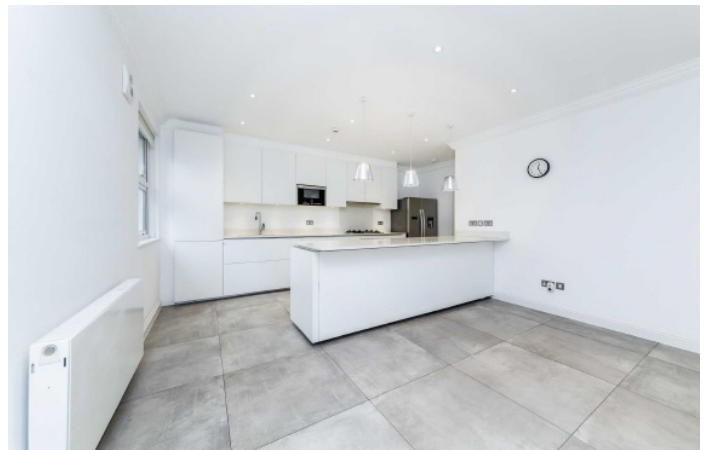
Netherhall Gardens, NW3