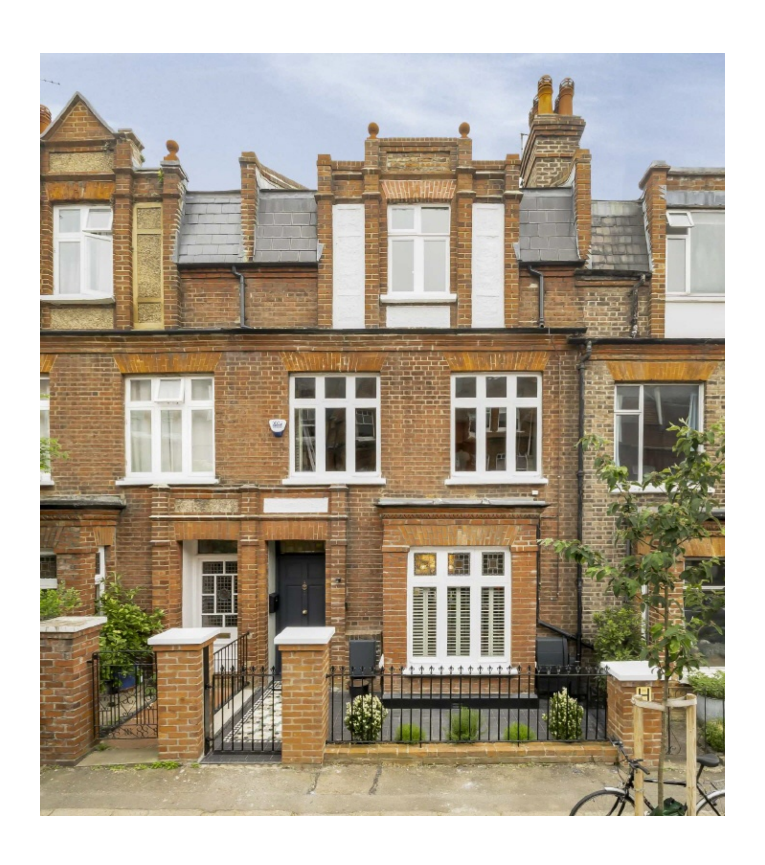
Lisburne Road, NW3 £2,750,000