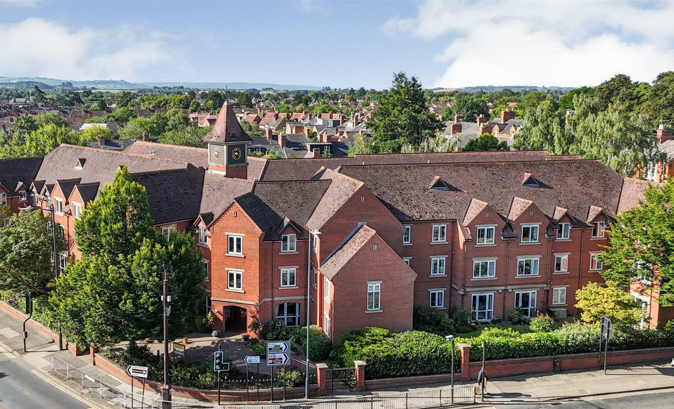
Scholars Court, Stratford-upon-Avon, CV37 6PN