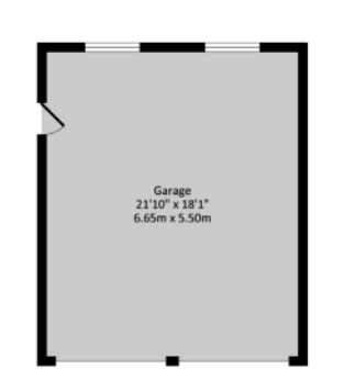
TOTAL APPROX. FLOOR AREA 2182 sq.ft. (202.70 sq.m.) approx.

Whilst every attempt has been made to ensure the accuracy of the floor plan contained here, measure the accuracy of the floor plan contained here, measure the accuracy of the floor plan contained here, measure the accuracy of the floor plan contained here, measure the accuracy of the floor plan contained here, measure the accuracy of the floor plan contained here, measure the accuracy of the floor plan contained here, measure the accuracy of the floor plan contained here, measure the accuracy of the floor plan contained here, measure the accuracy of the floor plan contained here, measure the accuracy of the floor plan contained here, measure the accuracy of the floor plan contained here, measure the accuracy of the floor plan contained here, measure the accuracy of the floor plan contained here, measure the accuracy of the floor plan contained here. of doors, windows, rooms and any other items are approximate and no responsibility is taken for any error, omission, or mis-statement. This plan is for illustrative purposes only and should be used as such by any prospective purchaser. The services, systems and appliances shown have not been tested and no guarantee as to their operability or efficiency can be given.