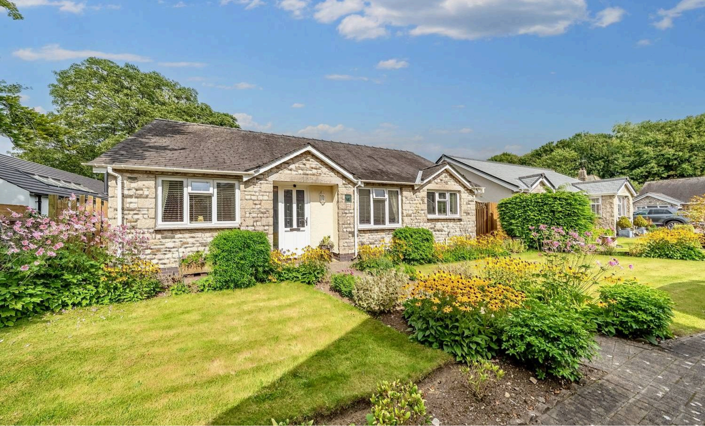
7 The Walled Garden, Sedgwick £450,000