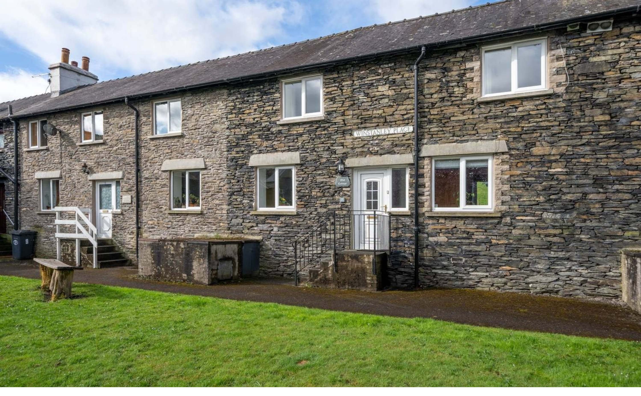
7 Winstanley Place, Bowston £279,000