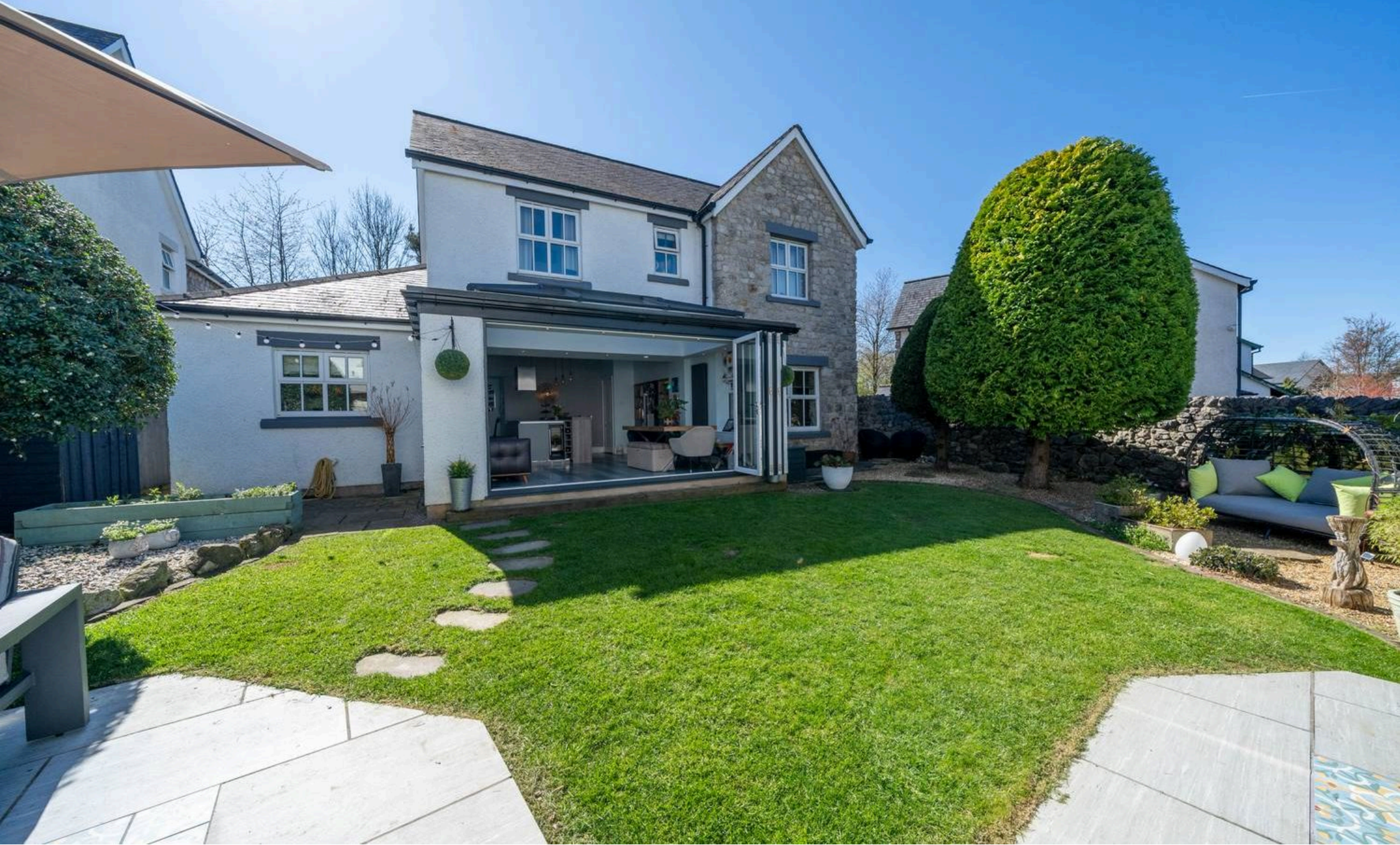
8 Blencathra Gardens, Kendal £575,000