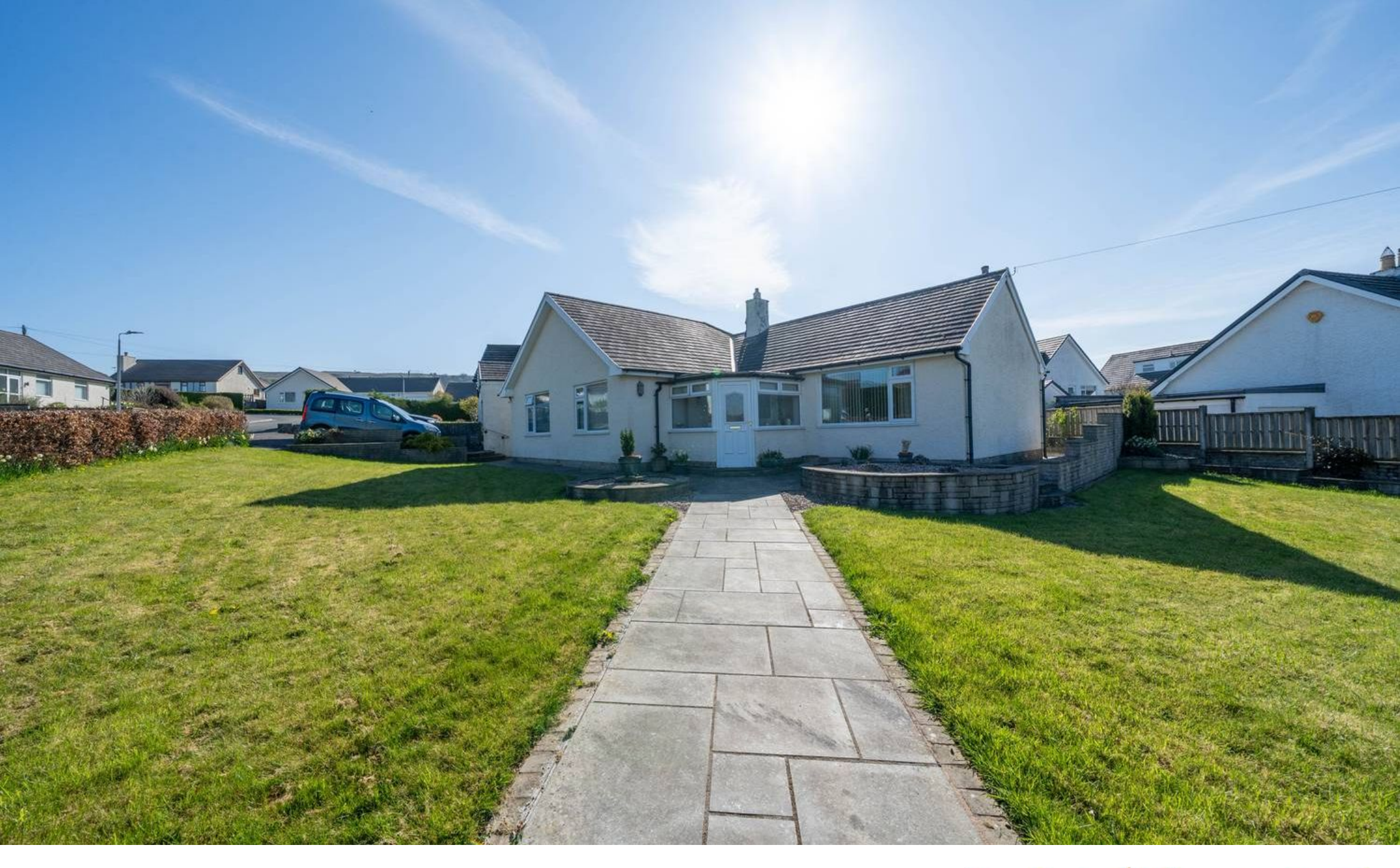
10 Abbey Drive, Natland £400,000