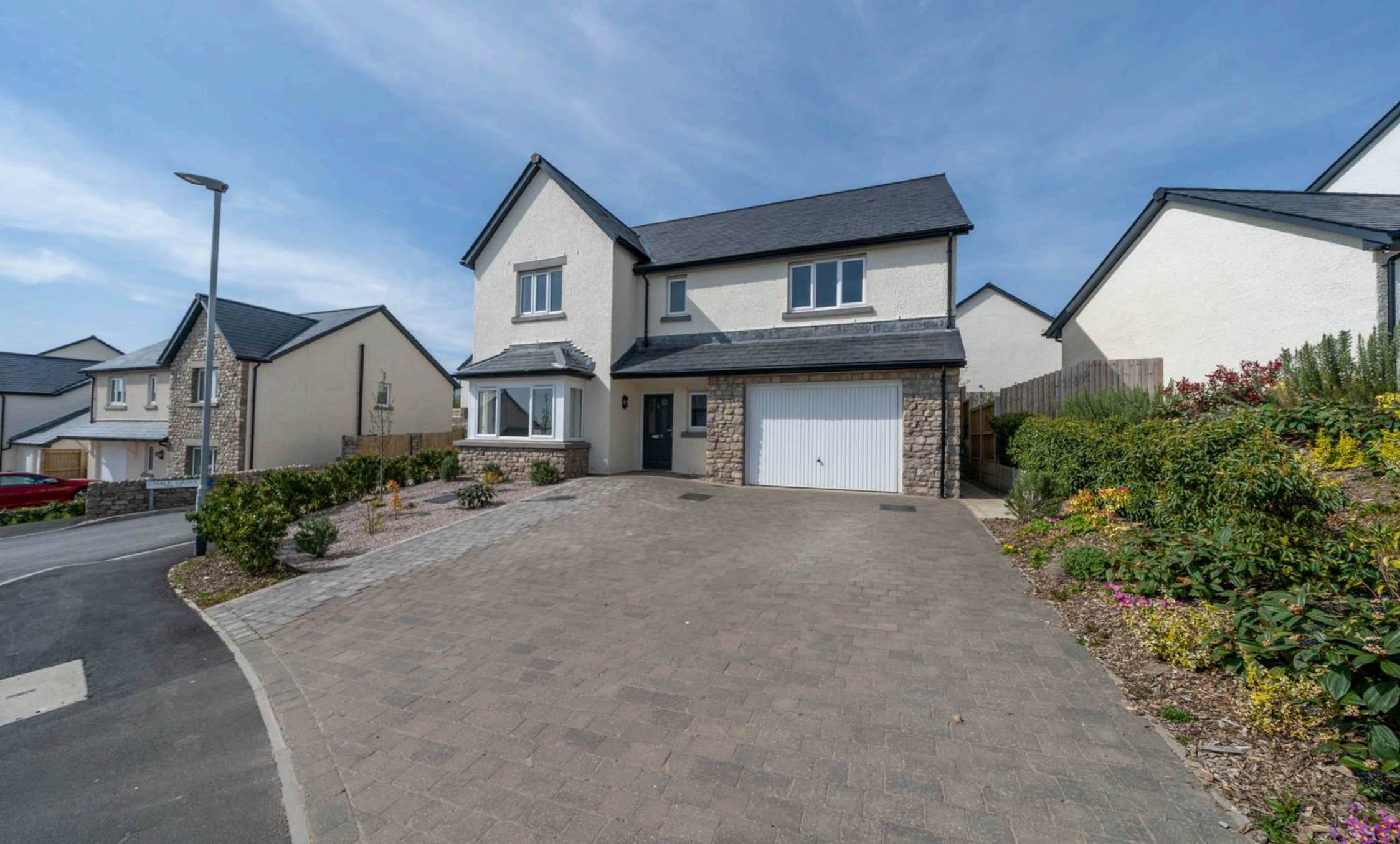
2 Chalk Grove, Kendal £680,000