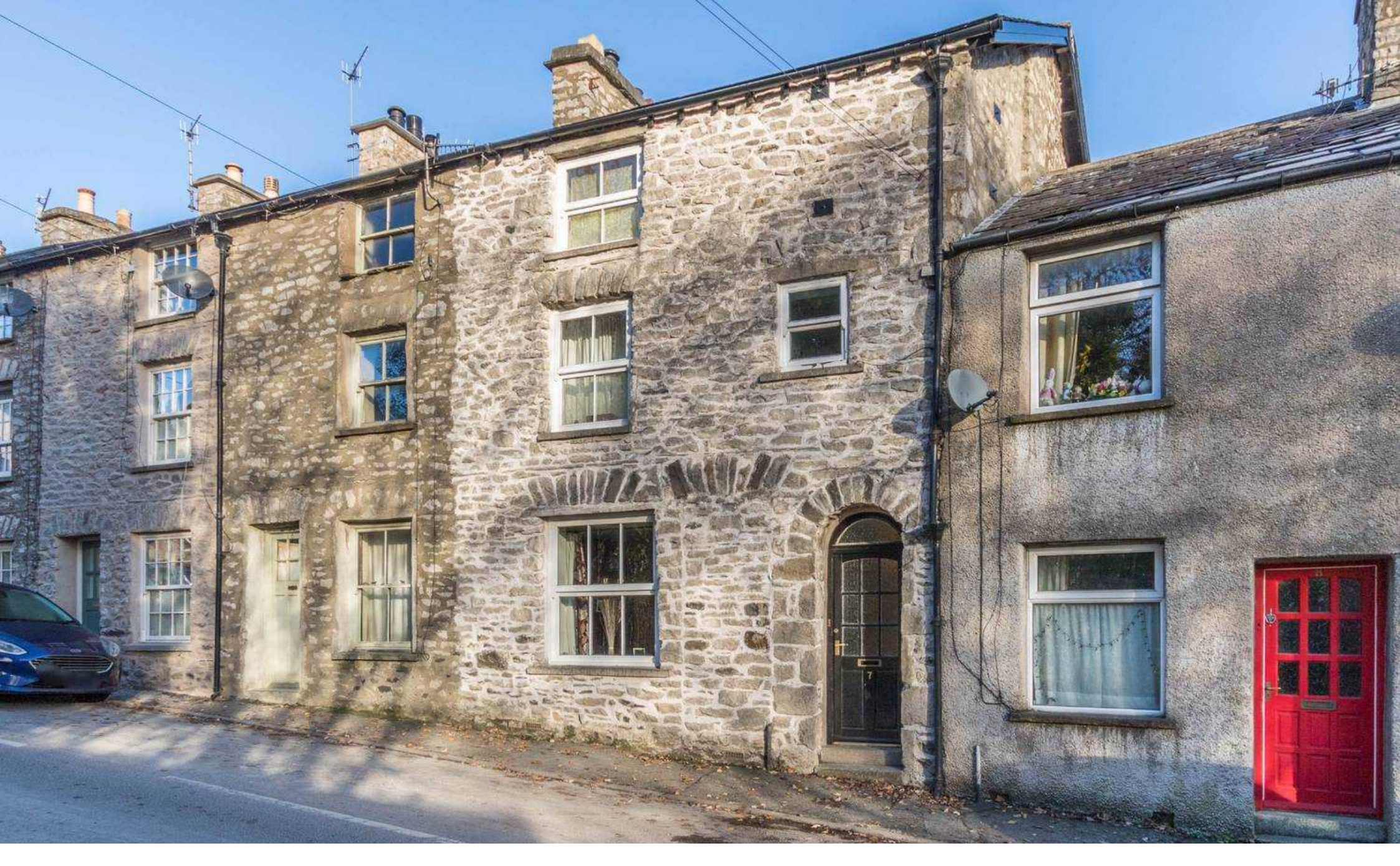
7 Dockray Hall Road, Kendal £300,000