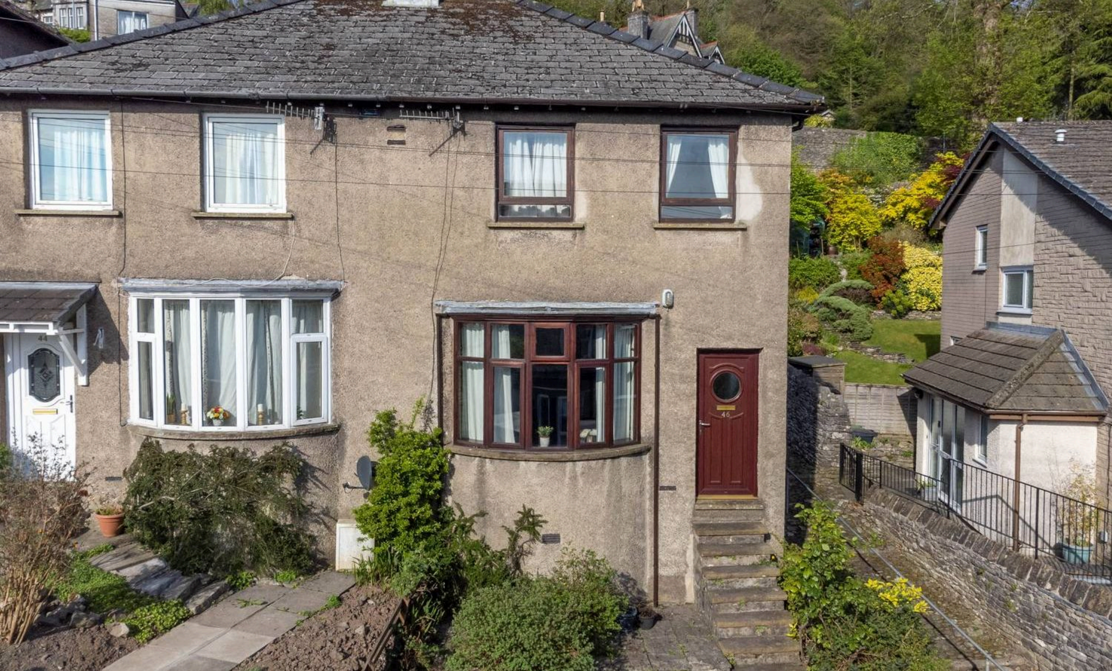
46 Serpentine Road, Kendal £270,000