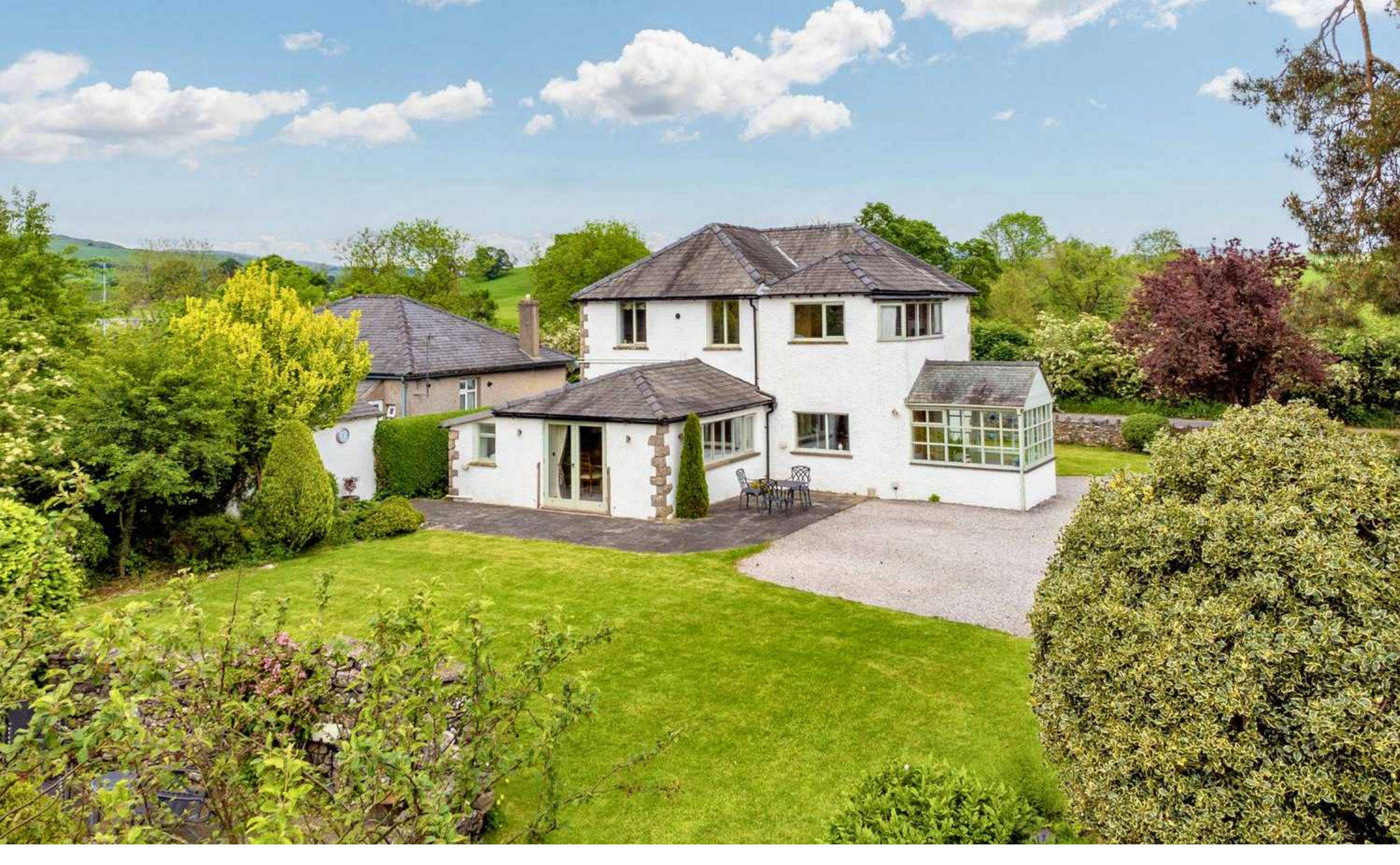
Carling House Carling Steps, Burneside £625,000