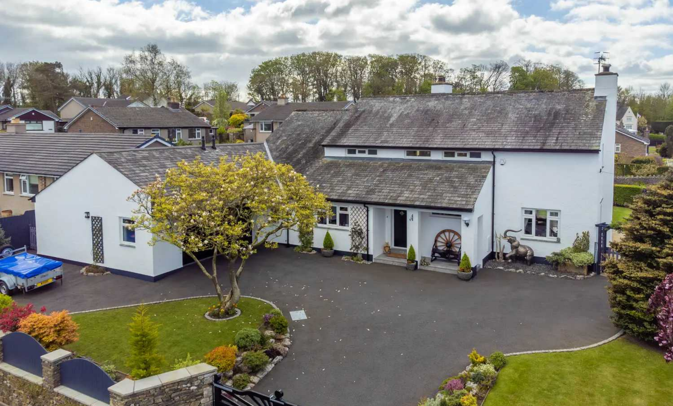
The Willows Dugg Hill, Heversham £750,000