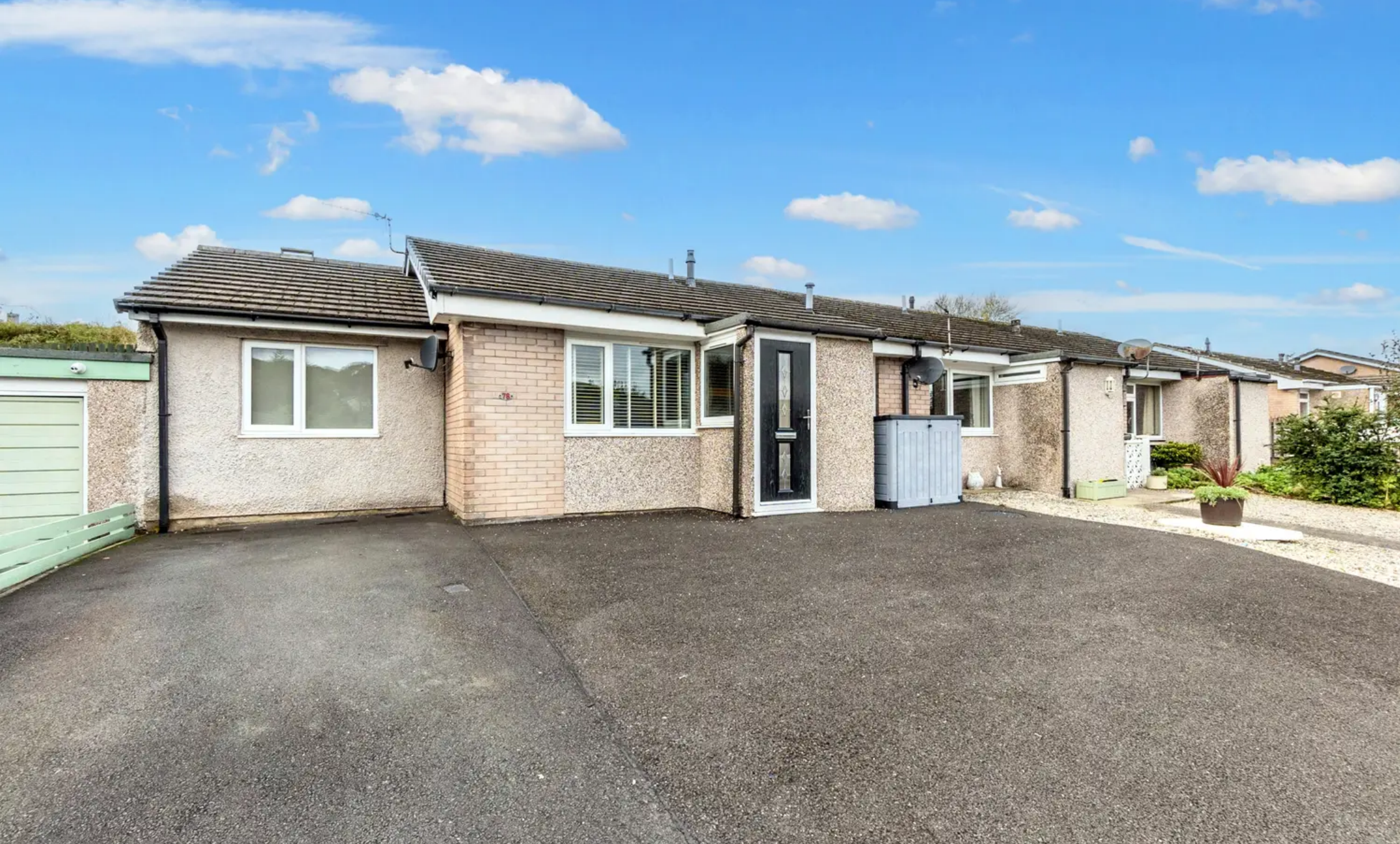
78 Rusland Park, Kendal £260,000