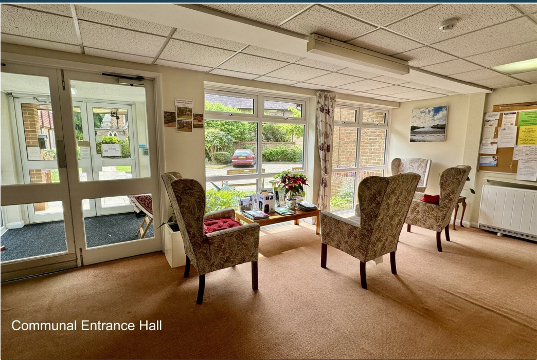
Communal Entrance Hall