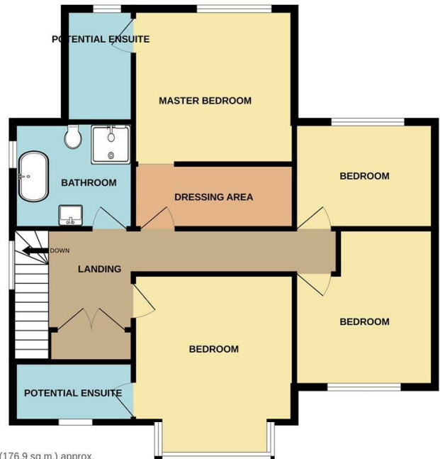
TOTAL FLOOR AREA: 1904 sq.ft. (176.9 sq.m.) approx.

Whilst every attempt has been made to ensure the accuracy of the floorplan contained here, measurements of doors, windows, rooms and any other items are approximate and no responsibility is taken for any error, omission or mis-statement. This plan is for illustrative purposes only and should be used as such by any prospective purchaser. The services, systems and appliances shown have not been tested and no guarantee as to their operability or efficiency can be given. Made with Metropix ©2024